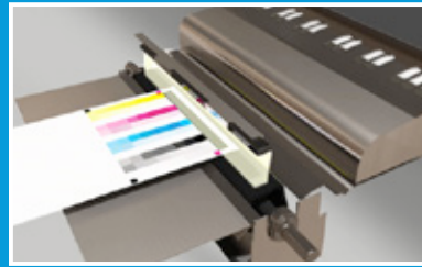
Full Width Array (FWA)

Automated Image-to-Media ensures perfect image alignment and front-to-back registration regardless of sheet size or media type—saving time and eliminating costly waste due to mis-registration or image skew.